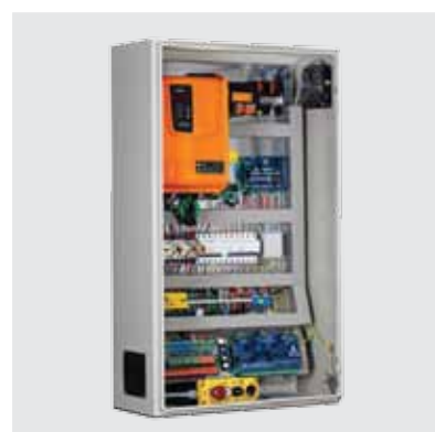
Integrated Gearless Control Panel