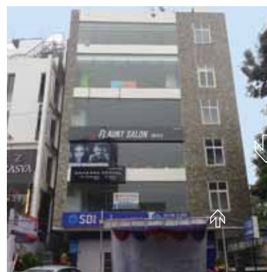
Dr. YV Rao Hospital (Hospital Lift installed)