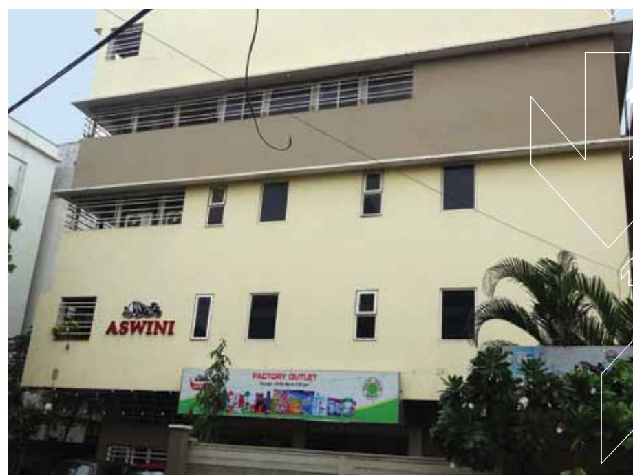
Aswini Hair Oil (All models installed)