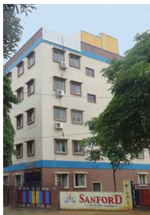
Sanford School, Miyapur (Standard Plus installed)