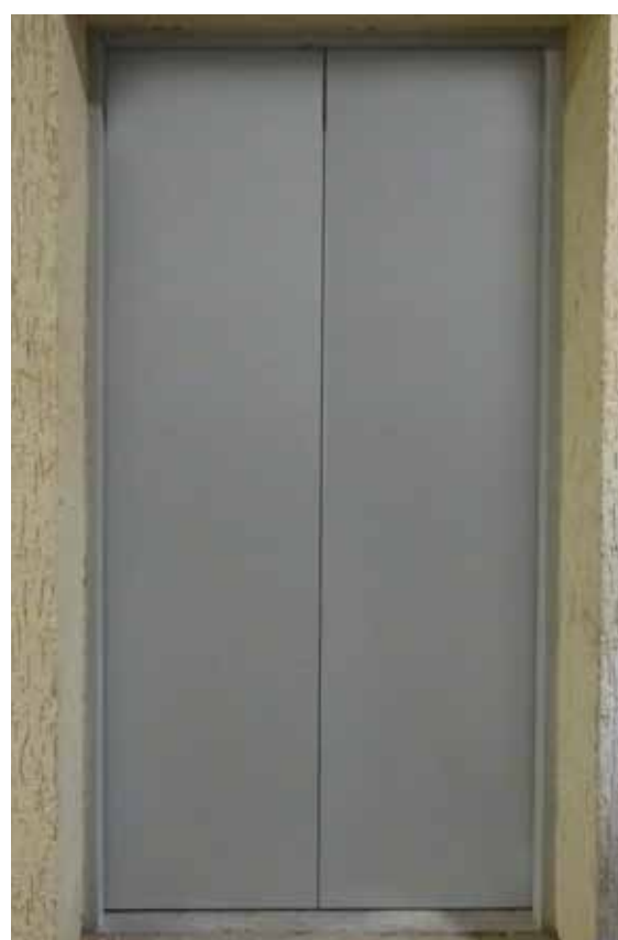
High Speed Automatic Door