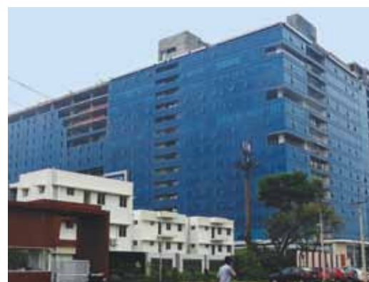
GAR Laxmi Infobahn, Kokapet (Tejas Lift installed)