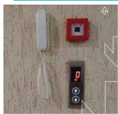
Landing Operating Panel (LOP)