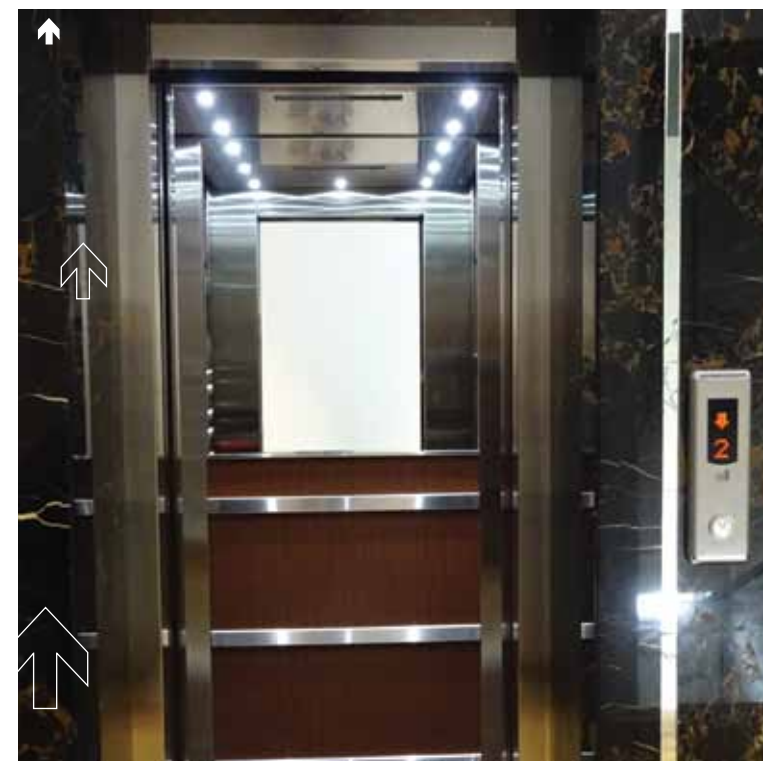
Green Home Lift