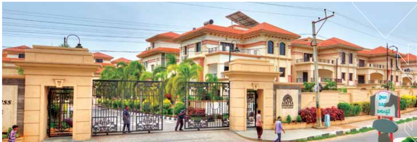
Aditya Empress Park, Shaikpet (Hydraulic Home Lift installed)

Few of prestigious projects in which our products has been installed