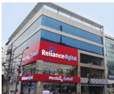
1000 Kg capacity (Tejas Lift installed)