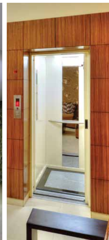
Premium Home Lift