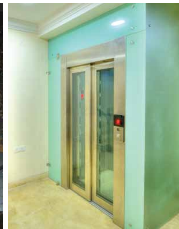
Premium Home Lift